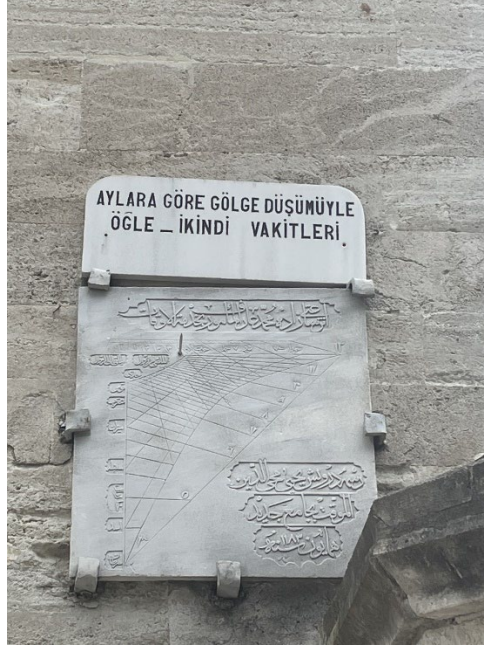
Sun Clock, 17 th Century, Uskudar, Istanbul, Turkey

The course explores the field of history and historical analysis while familiarizing the students with the basics of historical research and diverse approaches historians use. Students will learn how to analyze a variety of historical sources, will gain exposure to the diverse approaches to historical work, and will build foundational writing and citational skills.