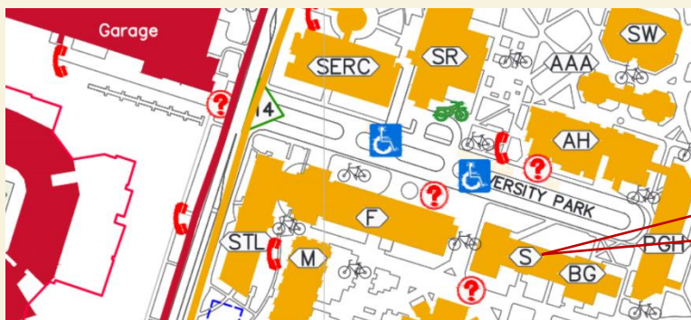
Image: Generated with Bing AI, modified with GIMP