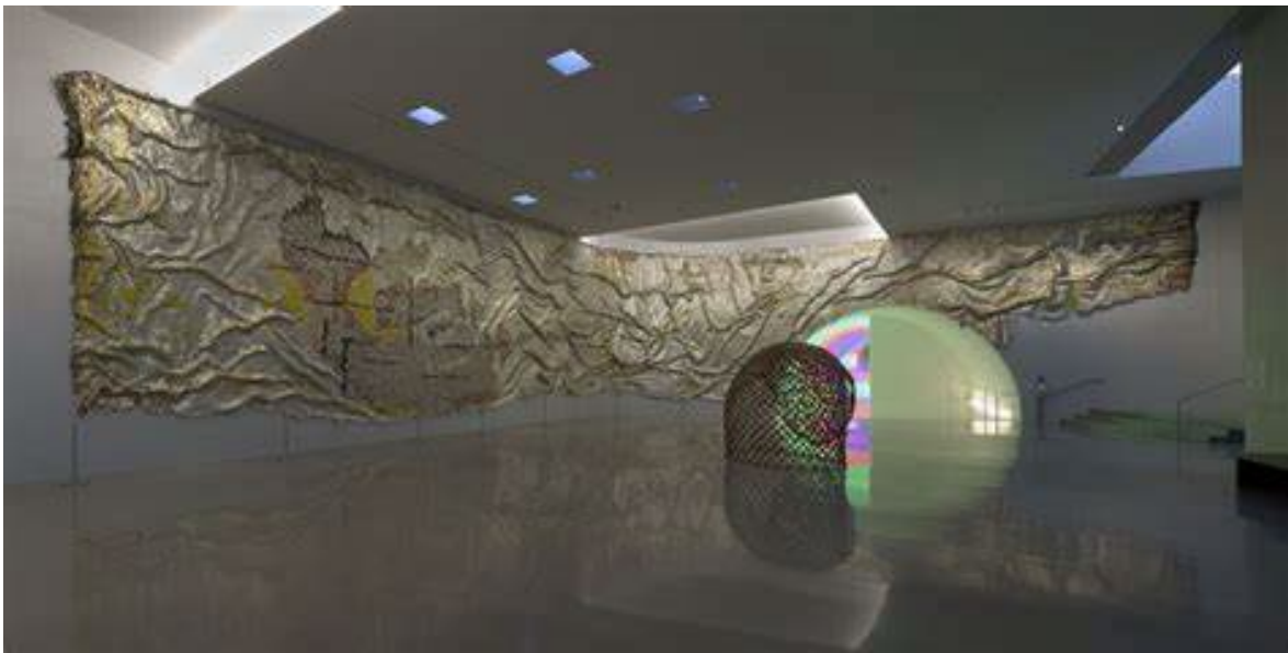
Image: Visitation by El Anatsui (Ghanaian, born 1944) Made in Nsukka, Nigeria, in 2020 from found aluminum and copper wire. Installed in the Museum of Fine Arts, Houston.

This course introduces students to the geography, history, politics, economics, arts, and cultures of sub-Saharan Africa with focus on historical events that contributed to modern-day realities, the diversity of African peoples and cultures, Africa's place in the world, and African diasporas of the past and present. Fulfills Language Philosophy Culture requirement in the University Core.