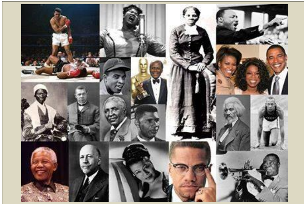
African Americans in Various Areas of America's History

HIST 2382, which can be substituted for HIST 1302, illustrates that African American life and culture continued to enrich the United States after 1865. Key questions in this course address social, political, and economic issues and the lives of black people in America. Cultural contributions are also linked to survival mechanisms and key questions. Spring 2025 will bring the general theme of African American business enterprises into focus.