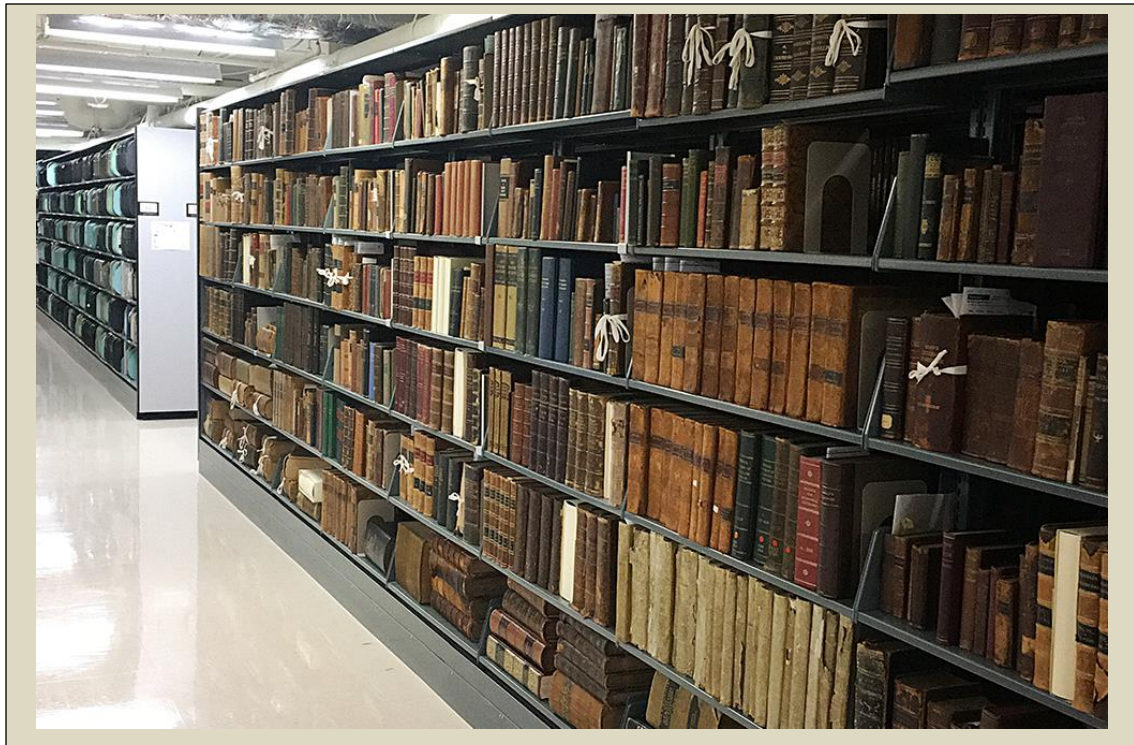
An Image from within UH Special Collections, M. D. Anderson Library

HIST 2303 will introduce students to historical research, writing, and critical thinking, including the fundamental tools that historians use and the range of work that they do. Students will learn how to analyze a variety of historical sources, will gain exposure to the diverse approaches to historical work, and will build foundational writing and citation skills. With a focus on 20 th century social justice topics, such as women's rights, and civil rights, the class will include applied workshops. Specifically, students will conduct research, cite sources and create a bibliography, analyze primary source material, as well as construct and present historical arguments.