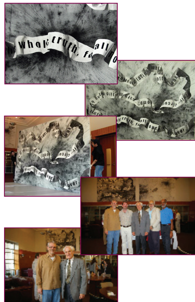
For a press release on the piece, please visit DABFOTO at www.dabfoto.com/ .