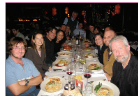
Picture from the L.A. alumni gathering in December

THE HONORS COLEGE ANNUAL FUND. Many thanks to all of you who have heeded the call and graciously donated to The Honors College Annual Fund. To date, we have received $18,769—congratulations Honors! The Annual Fund provides funds that serve students in The Honors College.