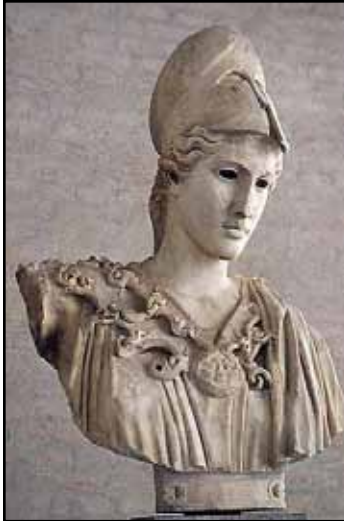
The clear-eyed goddess Athena, patron of the polis, of wisdom, and of war

An Interdisciplinary Program in Politics and Ethics Minor Housed in The Honors College