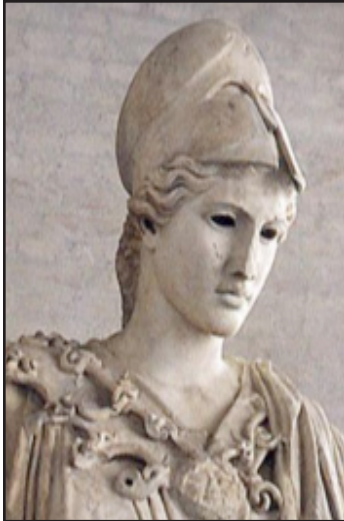
The clear-eyed goddess Athena, patron of the polis, of wisdom, and of war

Phronesis is the Greek word for prudence or practical wisdom. Aristotle identified it as the distinctive characteristic of political leaders and citizens in adjudicating the ethical and political issues that affect their individual good and the common good.