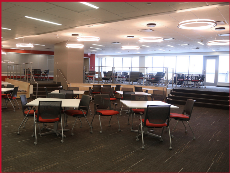
PharmD Student Handbook 2017-18